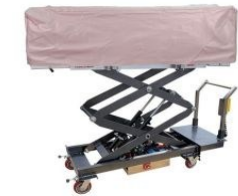
Shown with optional privacy frame & cover