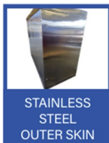
STAINLESS STEEL OUTER SKIN