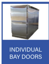
INDIVIDUAL BAY DOORS