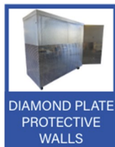
DIAMOND PLATE PROTECTIVE WALLS

Note: PathSUPPLY Inc can build any Grossing Station, Autopsy Table, and Stainless Steel Cabinets for the Morgue, Anatomy Lab, or Grossing Lab