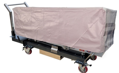
Shown with optional privacy frame & cover