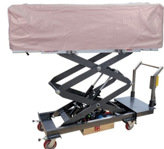
Shown with optional privacy frame & cover